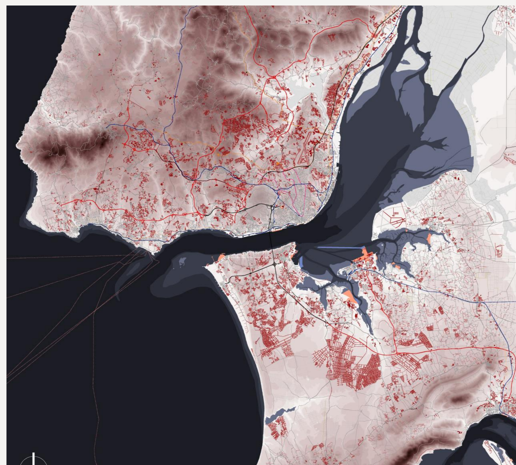
Urban transformations: 1966-1995 (infrastructures).